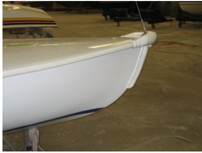
Bow & stem bumpers

In their brochure, the OCC Sailing School gives this little bit of advice: “Even if keelboats seem tempting to you, plan on taking at least two Lido classes before moving on to the Shields. Dinghy sailing is the best way to get the basics down pat, and will give you a sensitivity to the wind – and to the dynamics of sailboats – which will make you a far better big boat sailor.” We think that is very good advice! And we are proud that this dynamic sailing school as chosen to continue using Lido 14s.