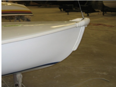
Bow & stem bumpers

sensitivity to the wind – and to the dynamics of sailboats – which will make you a far better big boat sailor.” We think that is very good advice! And we are proud that this dynamic sailing school as chosen to continue using Lido 14s.